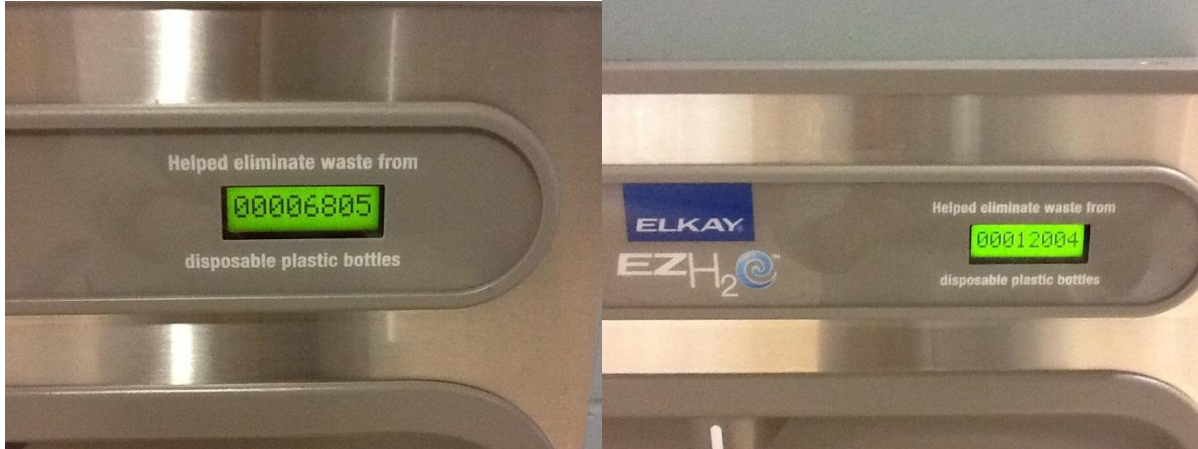
Counters which display the number of disposable plastic bottles which the water bottle filling stations helped eliminate

They have already saved well over 20,000 bottles since the installation last year.