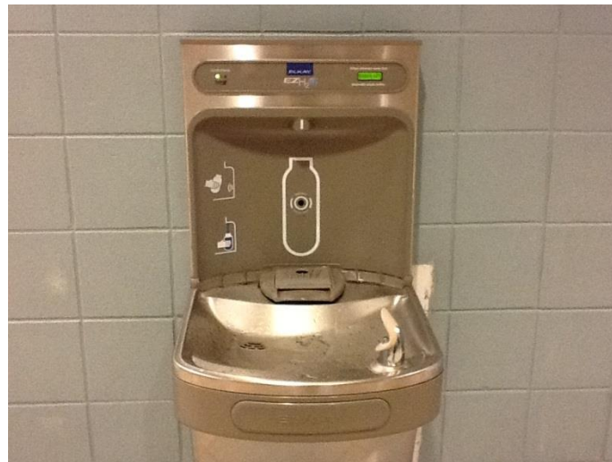
Water bottle filling station at Horton High School

Their school became bottled water free. They removed the machine dispenser and no longer sell bottled water in the school. The Environment Club sponsored beautiful metal water bottles with their logo and slogan "I make a Difference". The water bottles come in four colours and have the community sponsors listed as well. The reusable bottles sell for $3 and the profit was used to buy a water dispenser for the school designed to fill water bottles.