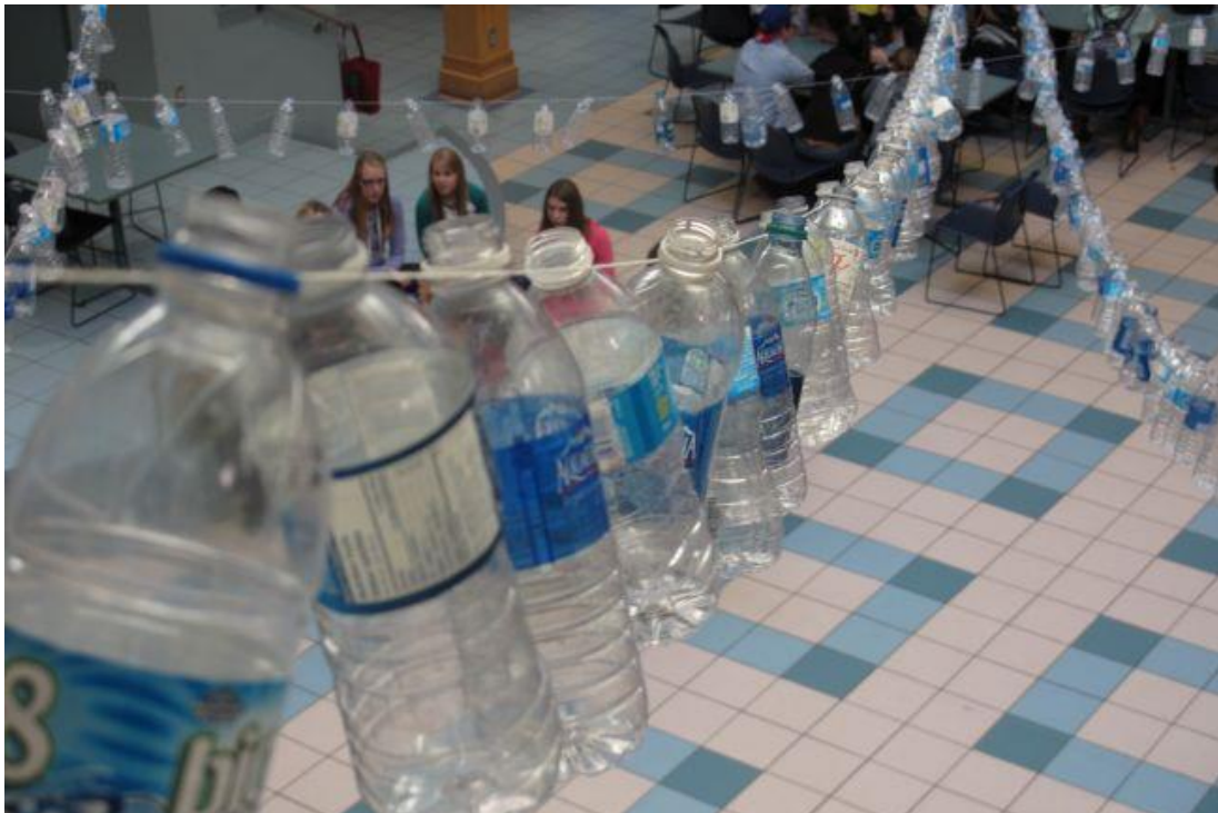
Plastic water bottles strung across cafeteria at Horton High School

As part of their campaign about water awareness and to encourage people to stop buying bottled water they collected plastic water bottles for three weeks and strung them all up across their cafeteria. It made quite an impact visually, to see how much waste was generated just by water bottles in a short period of time!